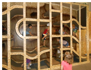
Muncie Children's Museum

(See the website for free days and exceptions to the schedule.)