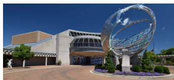
Minnetrista Cultural Center