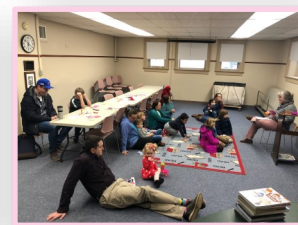
Valentine's Day Story and Craft time