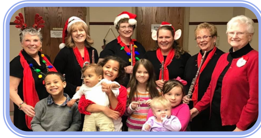
The Windsong Flute Ensemble had lots of help making merry as the kids sang, drummed, and jingled their bells.