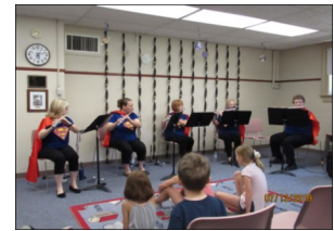
Windsong Flute Ensemble