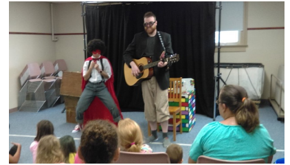
Minnetrista Theatre Preserves