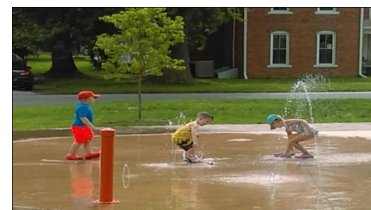
Cooling off at the splash pad