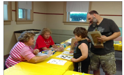
Lots of stations to try when Science Central comes to town!