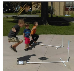
Making stomp rockets

"In Word After Word After Word , Ms. Mirabel, a visiting author, enchants a fourth-grade class as she teaches the students about writing and words. She speaks in hushed tones and laughs surprisingly. She wears feathers and pours dirt on the desk. Her lessons reach beyond words on paper. They gently and meaningfully change the way Lucy and her four friends handle the family dramas surfacing in their lives. This is an empowering story about the importance of discovering one's voice."