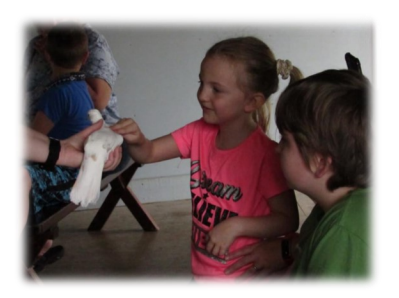
ZOOMOBILE—a great group of kids and their parents got to touch a big bullfrog, a dove, a large snake, and a tenrec.